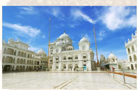
Patna Sahib Gurudwara